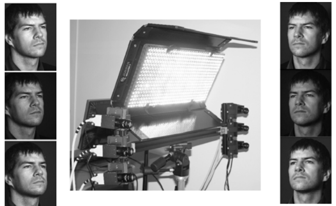
Figure 1: 4D Image Capture Rig and captured images.